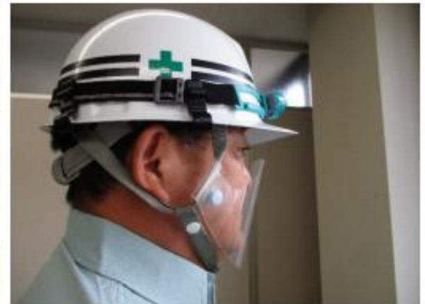
Wearing a mouse shield