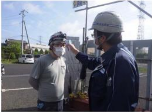
Body temperature measurement