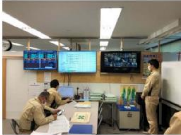
Using videophone tools