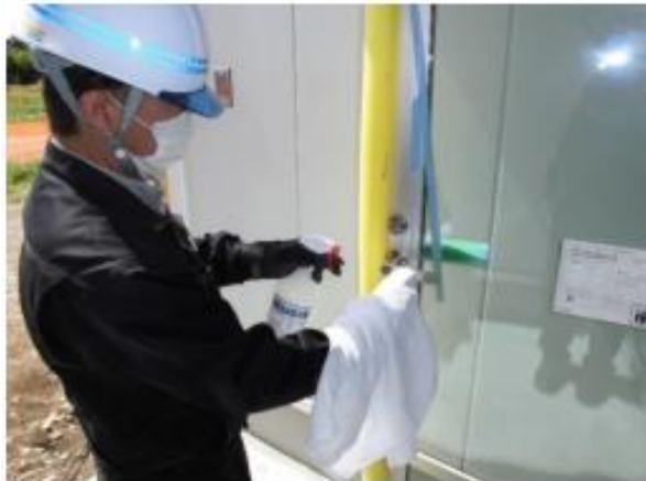
Disinfect the doorknob