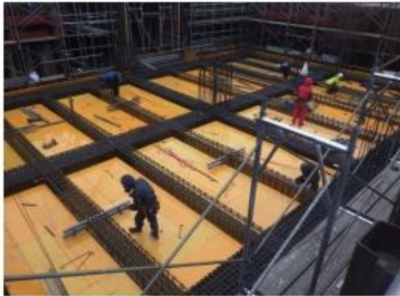
Securing intervals between workers