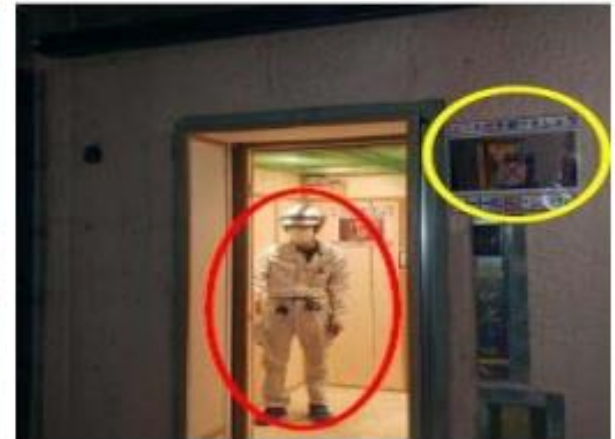
Limit the number of passengers on the lift